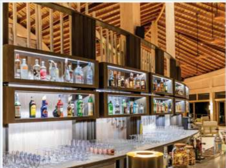
Ufaa Snack Bar