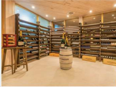
The Wine Cellar